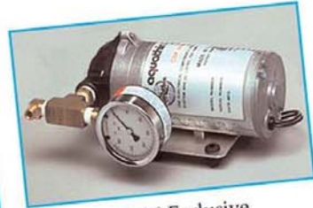
Aquathin's® Exclusive Optional "Zero Noise Platinum Booster Pump".

AQUATHIN® lites the way into the future of Water Purification with the AQUALITE™. The AQUALITE™ Water Purification System is comprised of three patents to give you the most effective and efficient water treatment system in the universe -- we Golden guarantee it! NO ONE DOES IT BETTER.