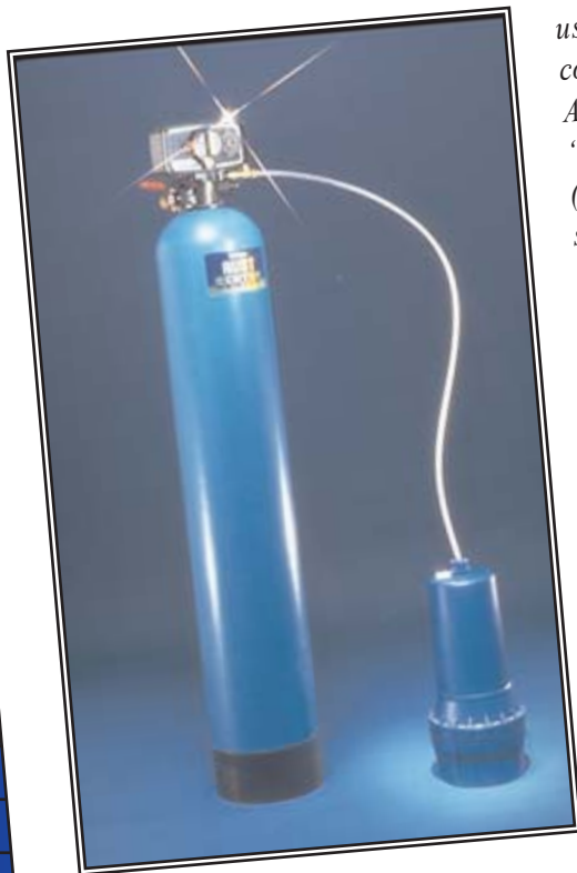
Potassium Permanganate Green Sand Tank